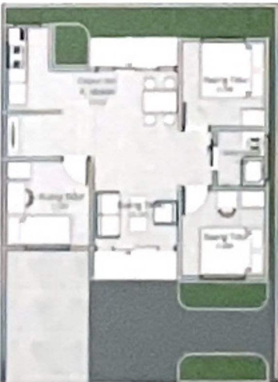
DENAH ALTERNATIF 2