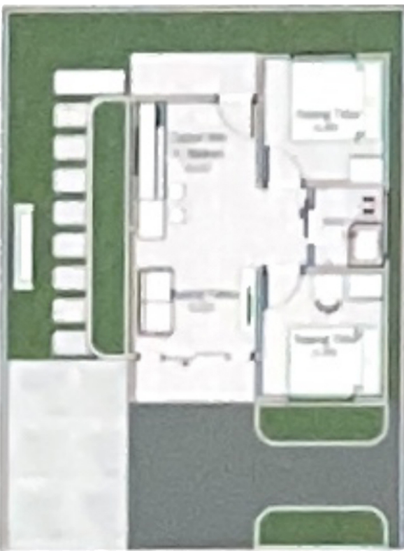
DENAH ALTERNATIF 1